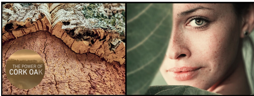
BIRKENSTOCK Natural Skin Care